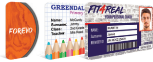
Online card template library